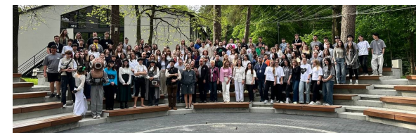
Camp Leadership Training Conference in Armenia, May 1-4