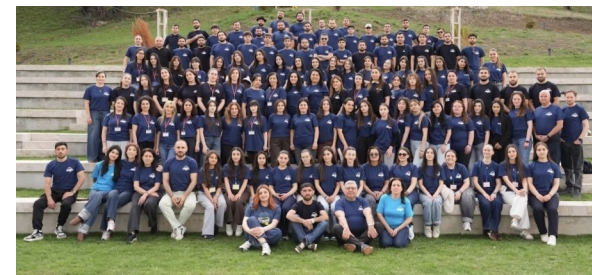
Camp Leadership Training Conference in Ukraine, May 14-17